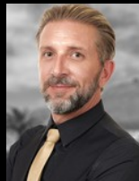
MIC BRAND 082 940 0167

DUPLEX PENTHOUSE FOR THE DISCERNING TENANT