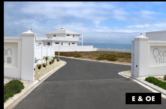
E & OE