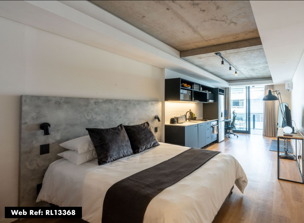
Web Ref: RL13368