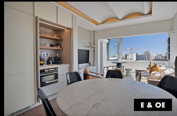
E & OE