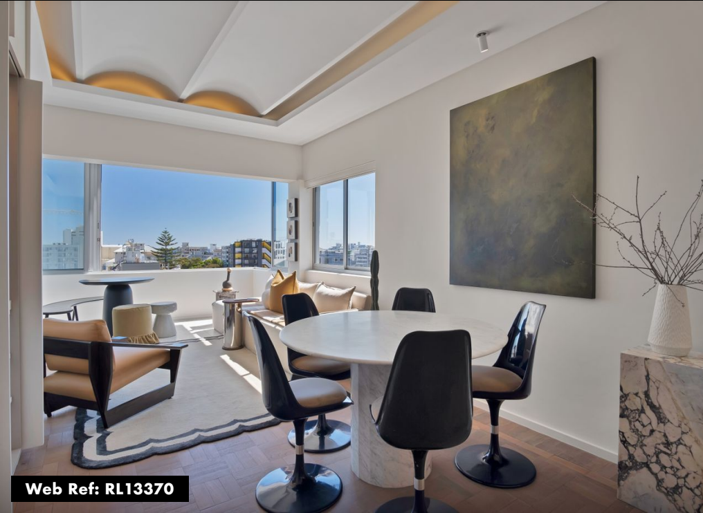
Web Ref: RL13370