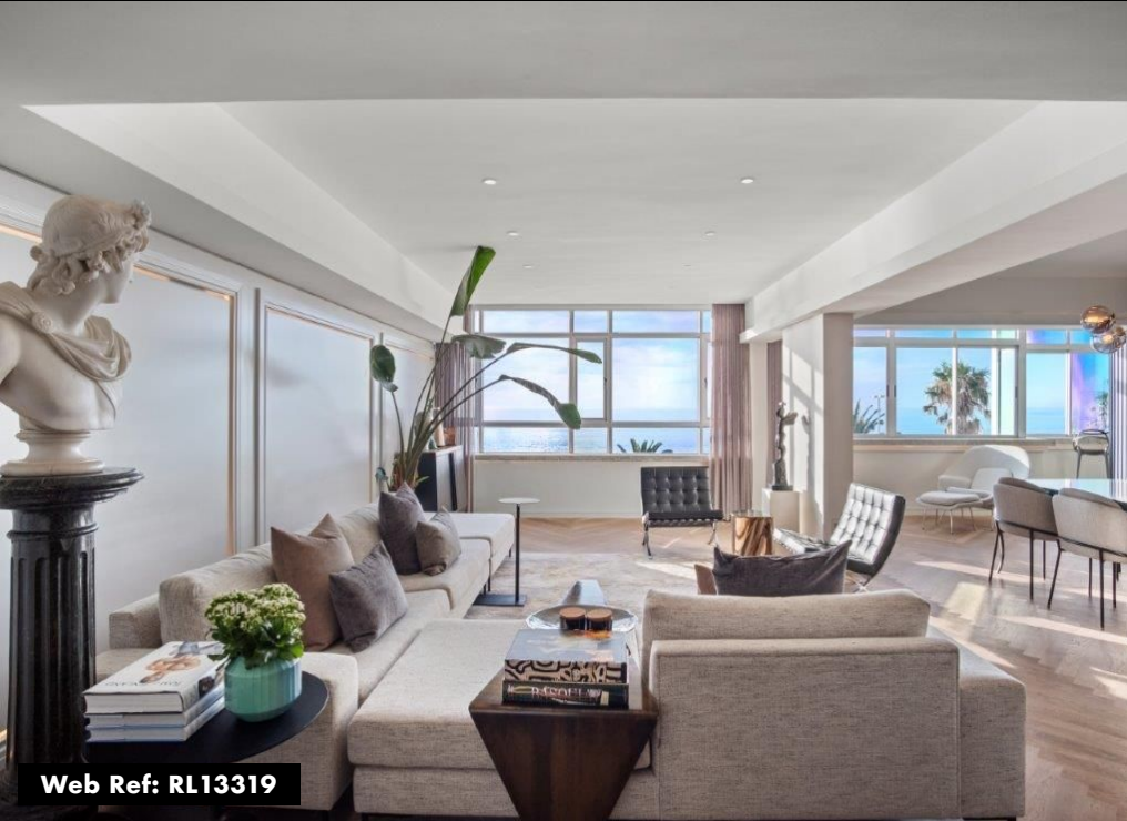
Web Ref: RL13319