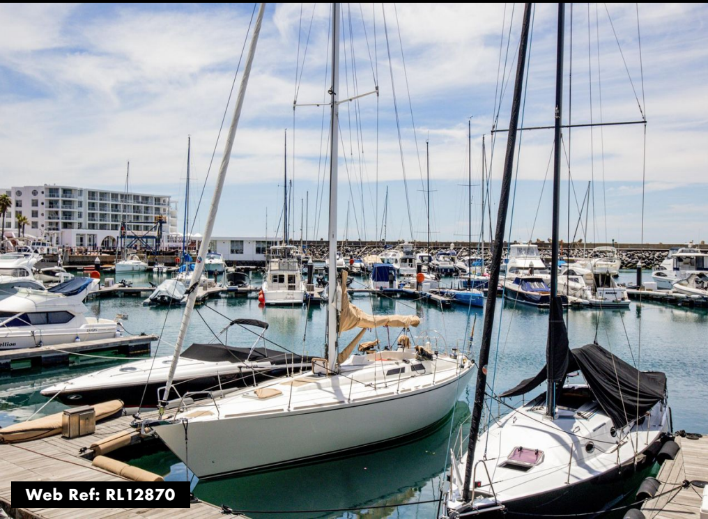
Web Ref: RL12870