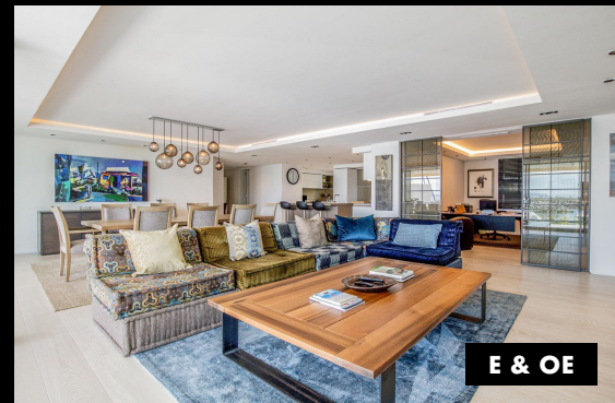
E & OE