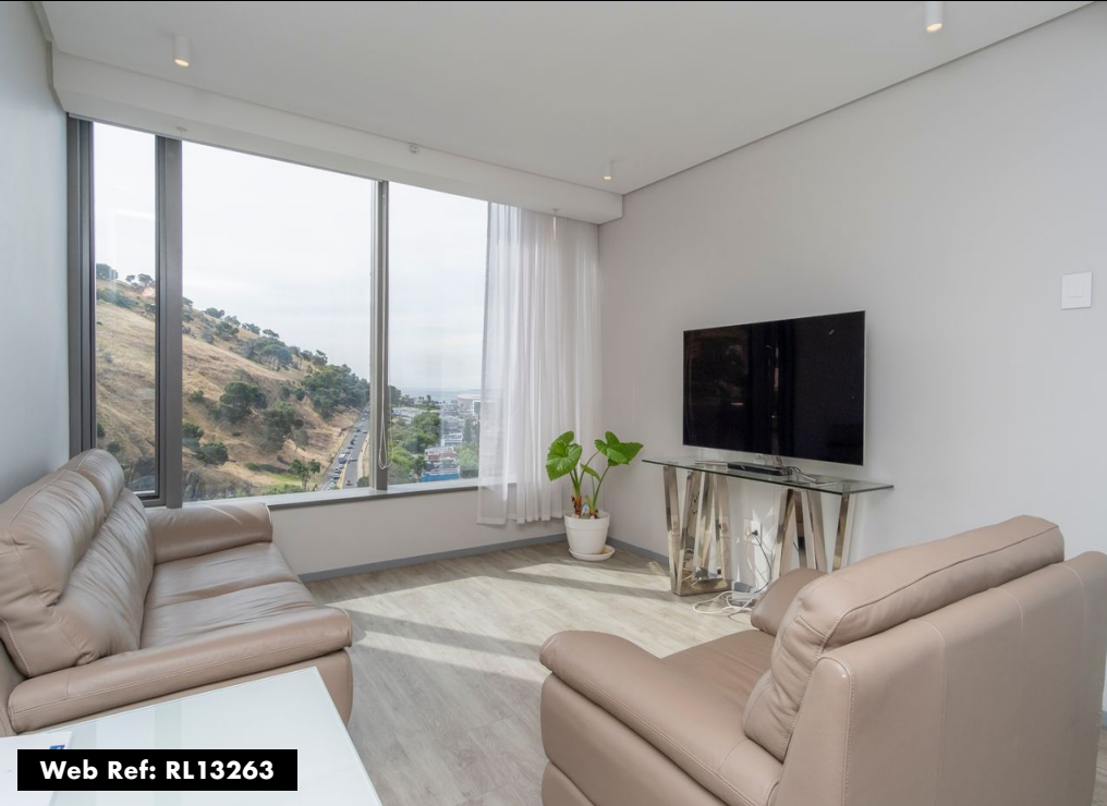
Web Ref: RL13263