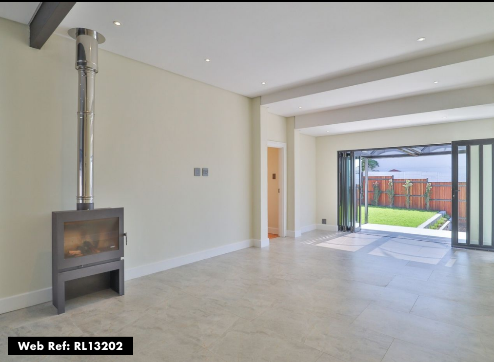
Web Ref: RL13202