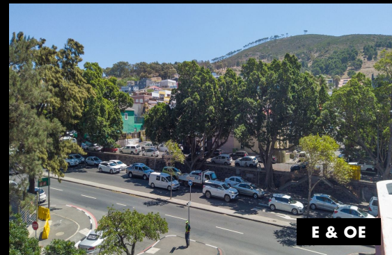
E & OE