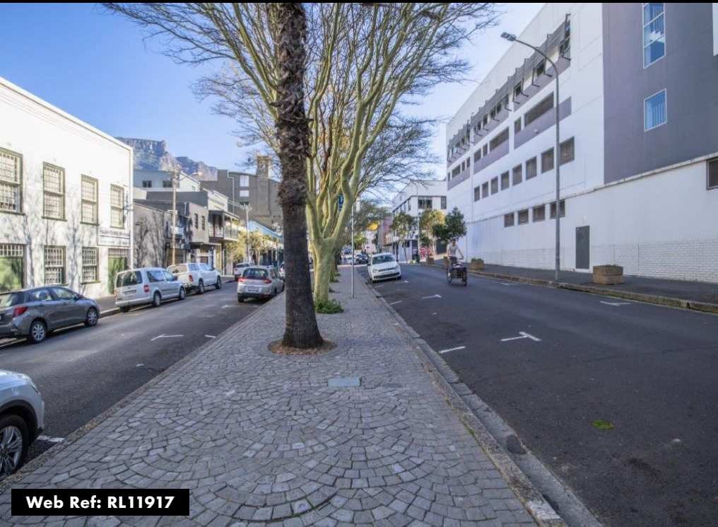
Web Ref: RL11917