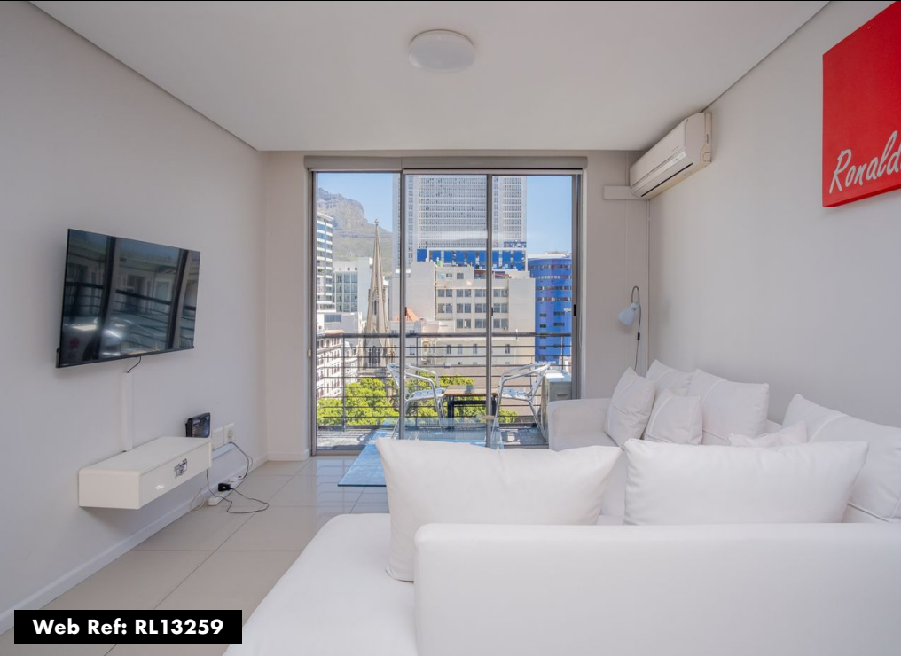
Web Ref: RL13259