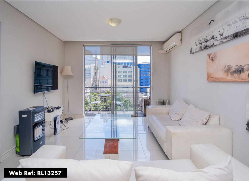
Web Ref: RL13257