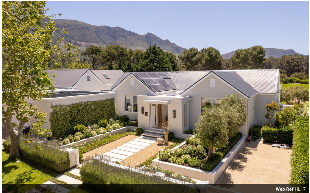
Web Ref HL17

DG Properties Cavendish Links 1 Cavendish Street Claremont Cape Town 7708