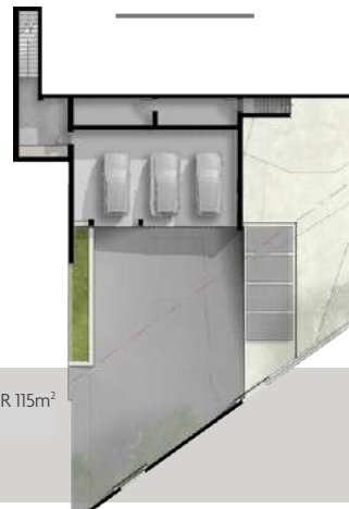
LOWER GROUND FLOOR 115m 2