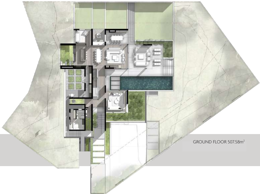
GROUND FLOOR 507.58m 2