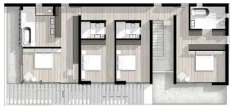
FIRST FLOOR 190m 2