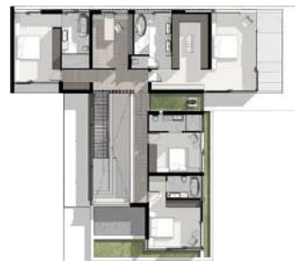
FIRST FLOOR 229m 2