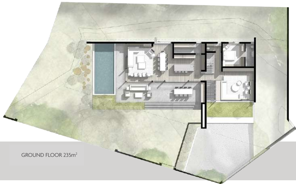
GROUND FLOOR 235m 2